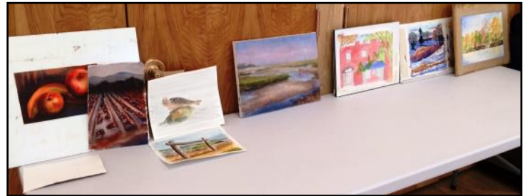
Ten artists at the first Open Studio on November 10 had a wonderful time painting, then had lunch and talked about their work.