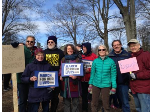
Above are but some of the many members of UUSA who took part in Marching for Our Lives events across our region on March 24. These UUs joined the Amherst Community March.