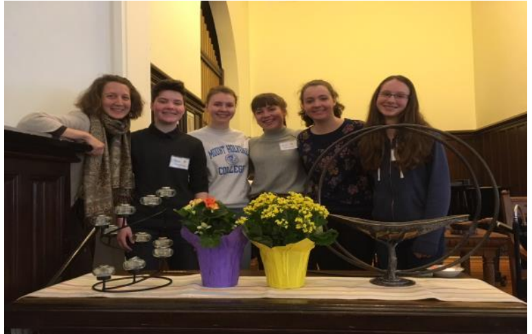
Thank you to the youth who led worship on April 8.